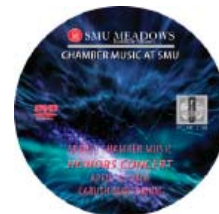
Performance DVD with DVD Authoring