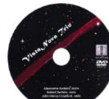
Performance DVD with DVD Authoring

Improve the chances of being accepted into major competitions, the top music schools and festivals. Students submitting BPC Recordings have been accepted to the following